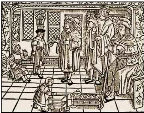
A Medieval woodcut showing the Seven Ages of Man from infancy to old age.

Thus begins the character Jaques's speech in Shakespeare's famous play, As You Like It where he goes on to describe the different stages of human life from infancy to old age. The Seven Ages of